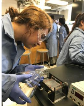
PEERS students participating in lab work.