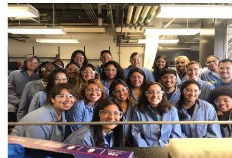
PEERS Students participating in the Biomedical Sciences Enrichment Program.

Apply in the fall for a $3,000 award to do research in the winter and spring quarters