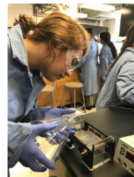
PEERS students participating in the Biomedical Sciences Enrichment Program.