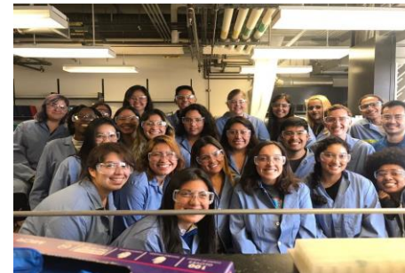
PEERS Students participating in the Biomedical Sciences Enrichment Program.

Apply in the fall for a $3,000 award to do research in the winter and spring quarters