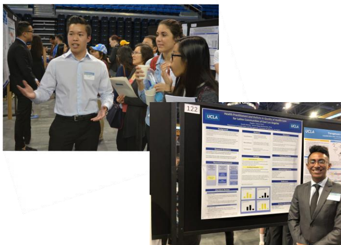
PEERS students presenting their research at Research Poster Day.