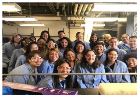
PEERS Students participating in the Biomedical Sciences Enrichment Program.

Apply in the fall for a $3,000 award to do research in the winter and spring quarters