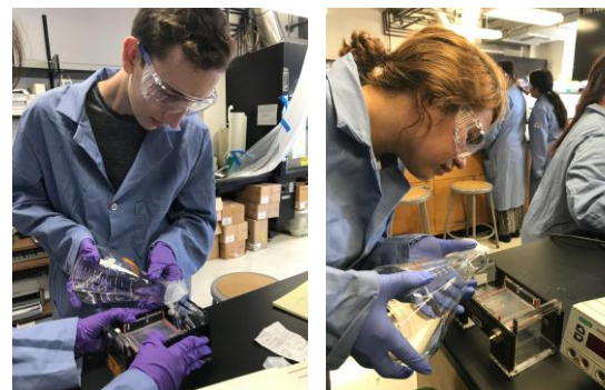
PEERS students participating in the Biomedical Sciences Enrichment Program.

PEERS students are encouraged to engage in undergraduate research. The PEERS staff assists students in identifying appropriate faculty mentors and obtaining financial support for research during the academic year and summer. PEERS students are very successful. Following PEERS, many alumni participate in prestigious undergraduate research programs, such as Maximizing Access to Research Careers, UC LEADS, and CARE Scholars. PEERS alumni are now in top graduate and professional schools across the country!