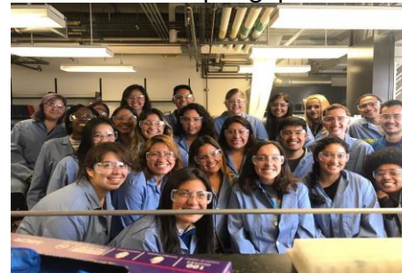
PEERS Students participating in the Biomedical Sciences Enrichment Program.

Apply in the fall for a $3,000 award to do research in the winter and spring quarters