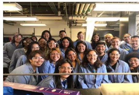
PEERS Students participating in the Biomedical Sciences Enrichment Program.

Apply in the fall for a $2,000 award to do research in the winter and spring quarters