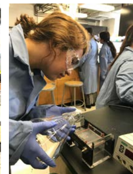
PEERS students participating in the Biomedical Sciences Enrichment Program.