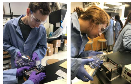
PEERS students participating in the Biomedical Sciences Enrichment Program.

PEERS students are encouraged to engage in undergraduate research. The PEERS staff assists students in identifying appropriate faculty mentors and obtaining financial support for research during the academic year and summer. PEERS students are very successful. Following PEERS, many alumni participate in prestigious undergraduate research programs, such as Maximizing Access to Research Careers, UC LEADS, and MSD Scholars. PEERS alumni are now in top graduate and professional schools across the country!